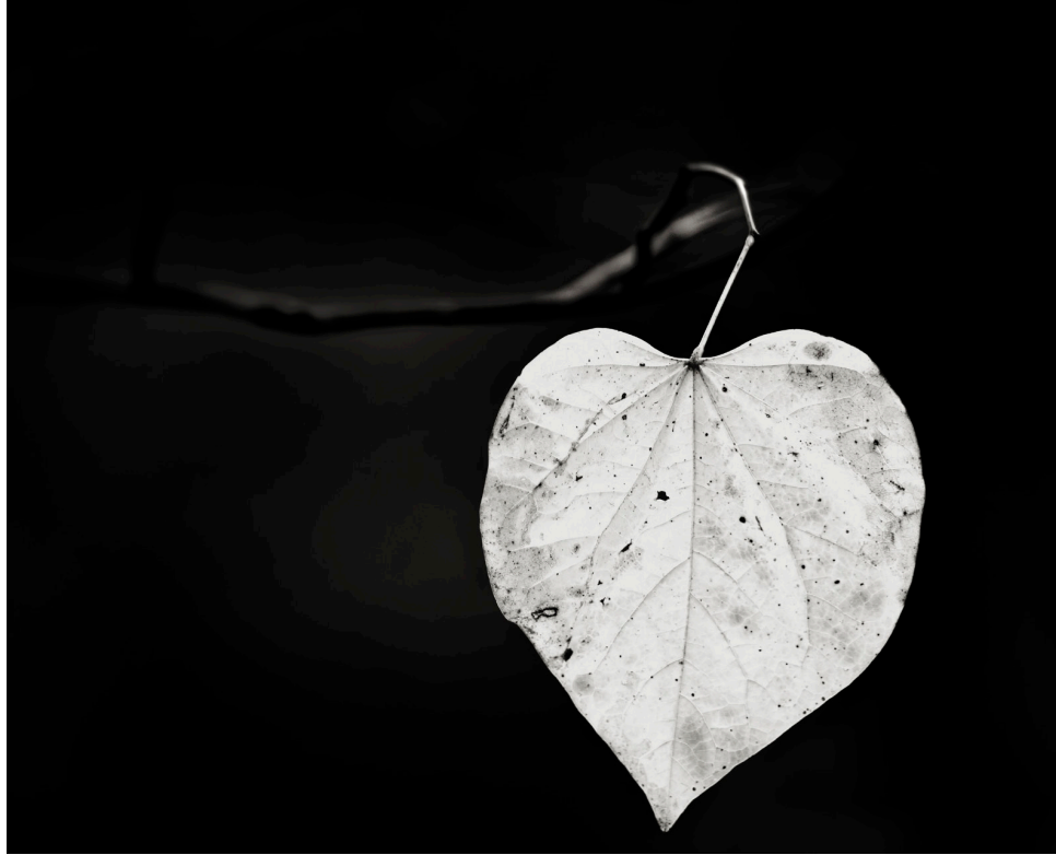
last leaf standing donna winters

Never say there is nothing beautiful in the world anymore. There is always something to make you wonder in the shape of a tree, the trembling of a leaf.